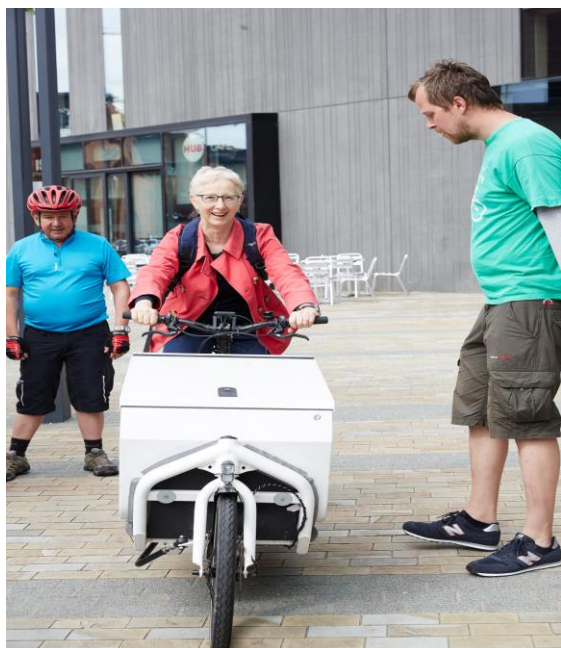
Figure 5: ACE Cycle Event Manchester, 15.06.17