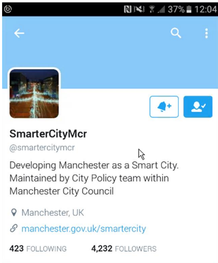
Figure 2 Manchester City Council, Smart City Twitter Page

Twitter identified as the main social media tool